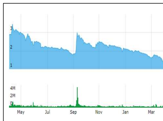
Anupam Finserv Ltd